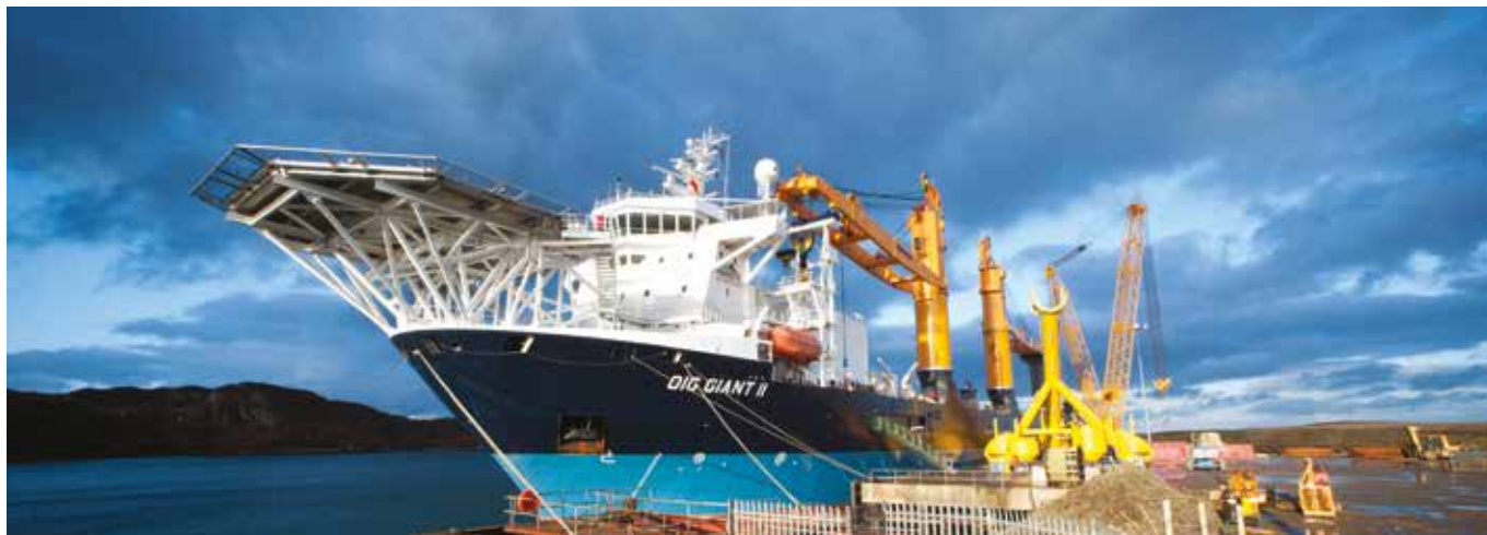
The OIG Giant II ship berthed at Arnish in the Outer Hebrides