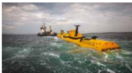
The Scotrenewables Tidal Turbine being towed in to position by a MultiCat vessel, Orkney