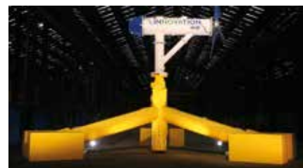
Nova Innovation's 30kW Nova 30 device